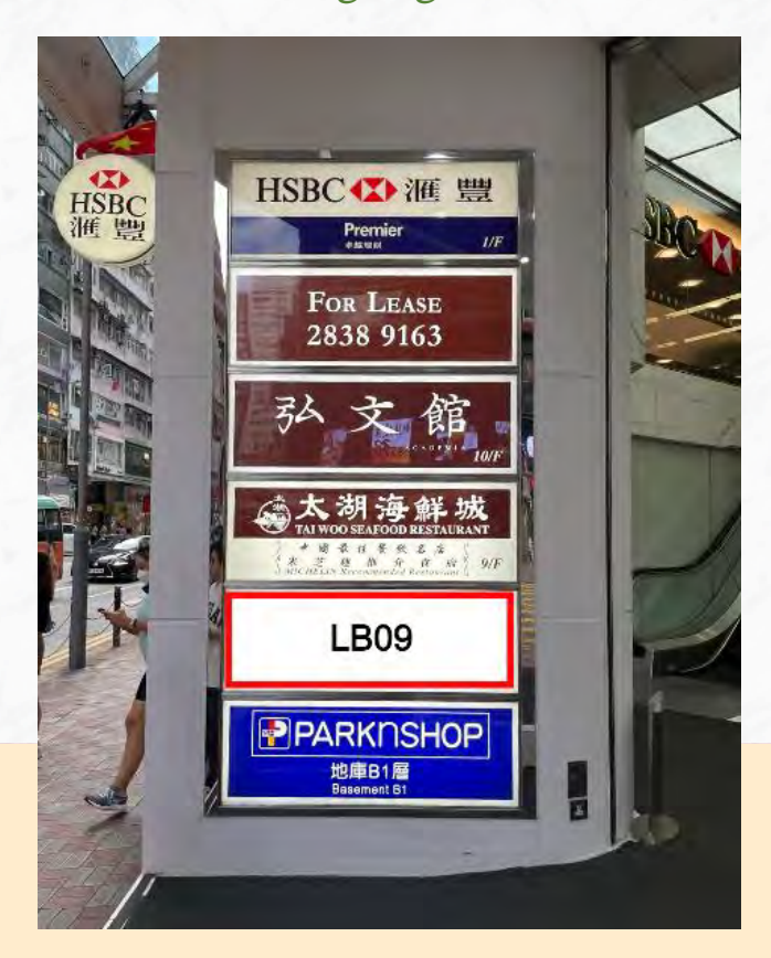
G/F facing Percival Street