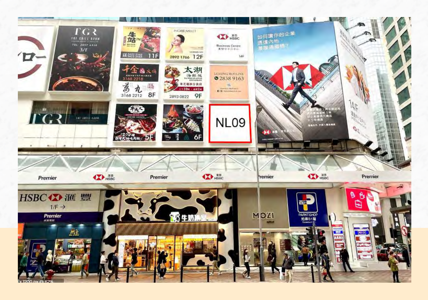
facing Lockhart Road