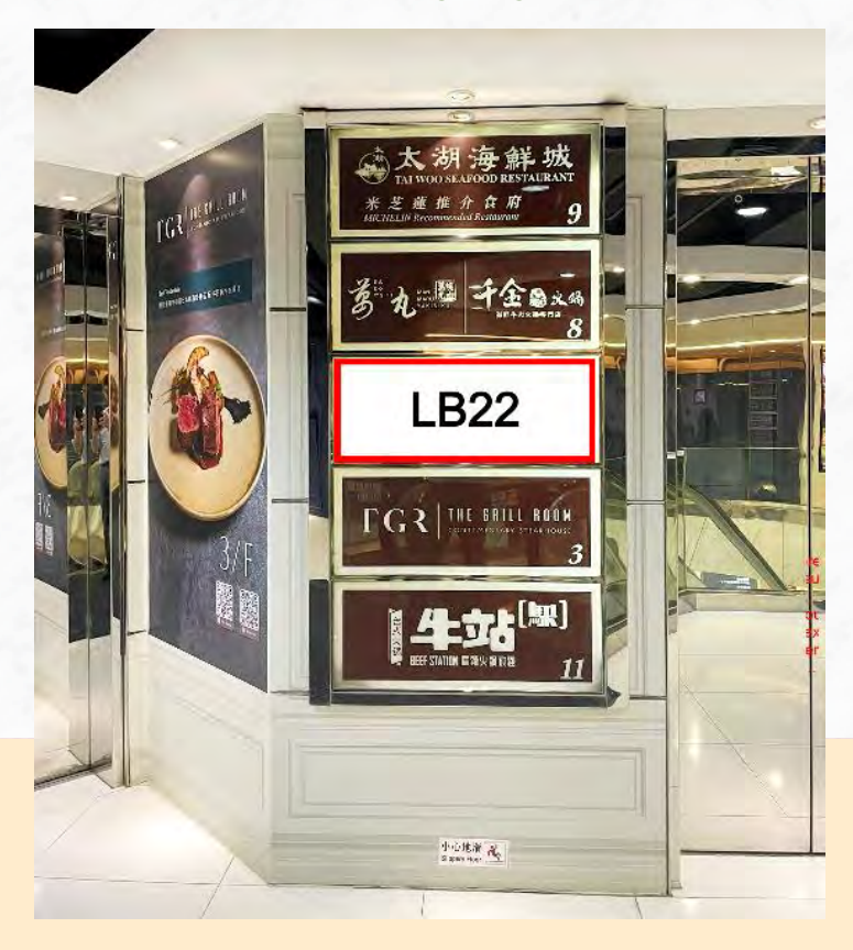
2/F Causeway Bay Plaza 2