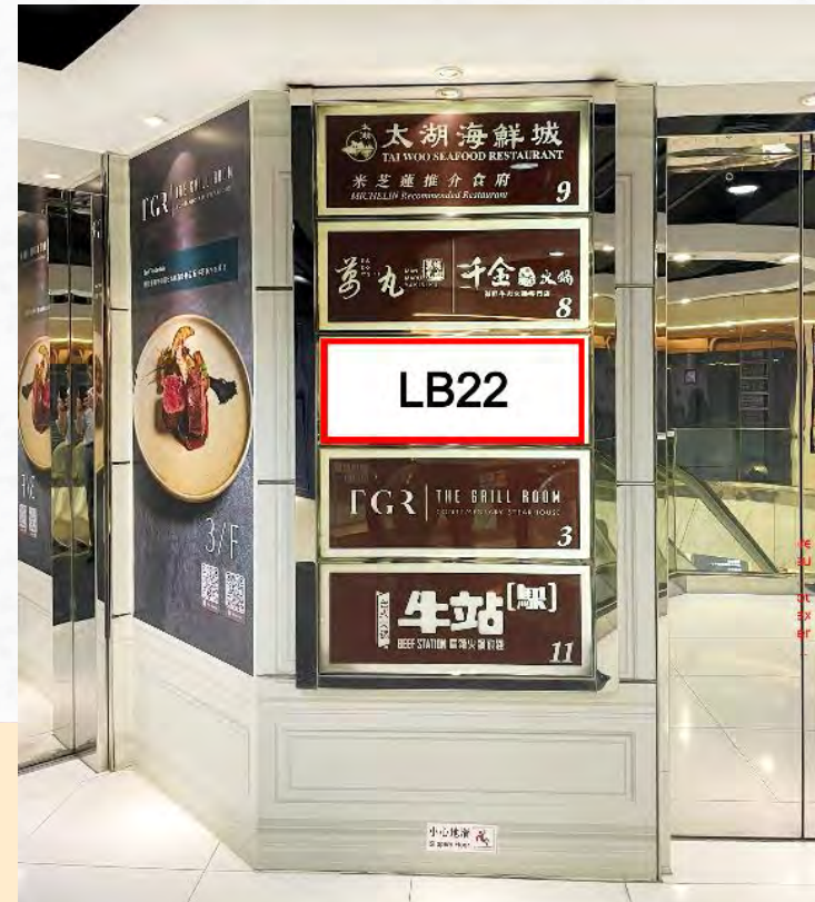
2/F Causeway Bay Plaza 2