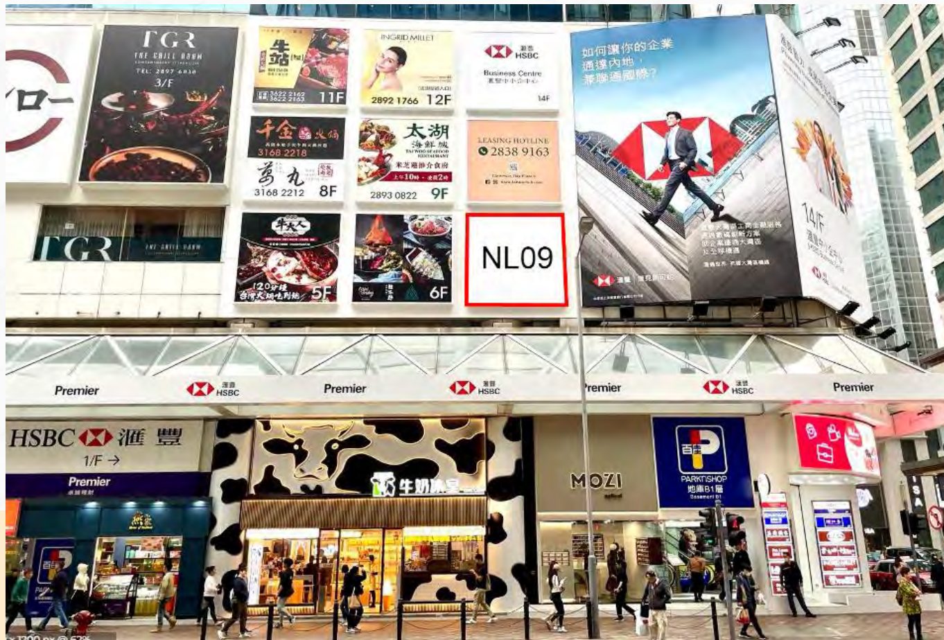
facing Lockhart Road