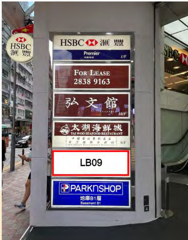
G/F facing Percival Street